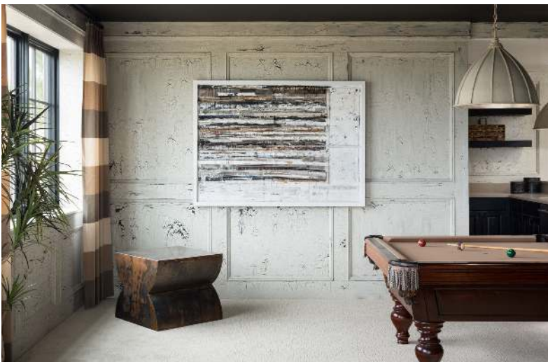
ASID Crystal Awards

Our favorite aspect of the project was the fantastic fixed finishes, which included gorgeous natural stone running along the interior walls, warm hardwood flooring through the main level, rich marbles and travertine in the bathrooms and stunning light fixtures throughout.