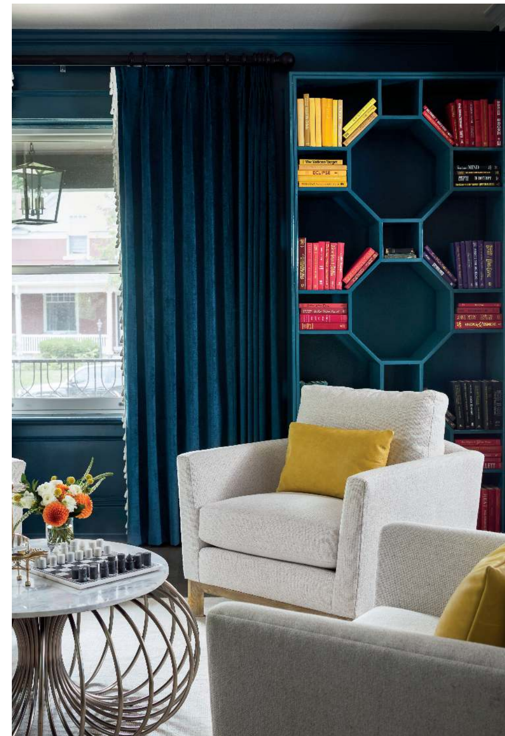
Above: In the library, a Mones bookcase from CFC features octagonal shelves and was custom-painted to match the walls. The homeowners requested the books be sorted by color.