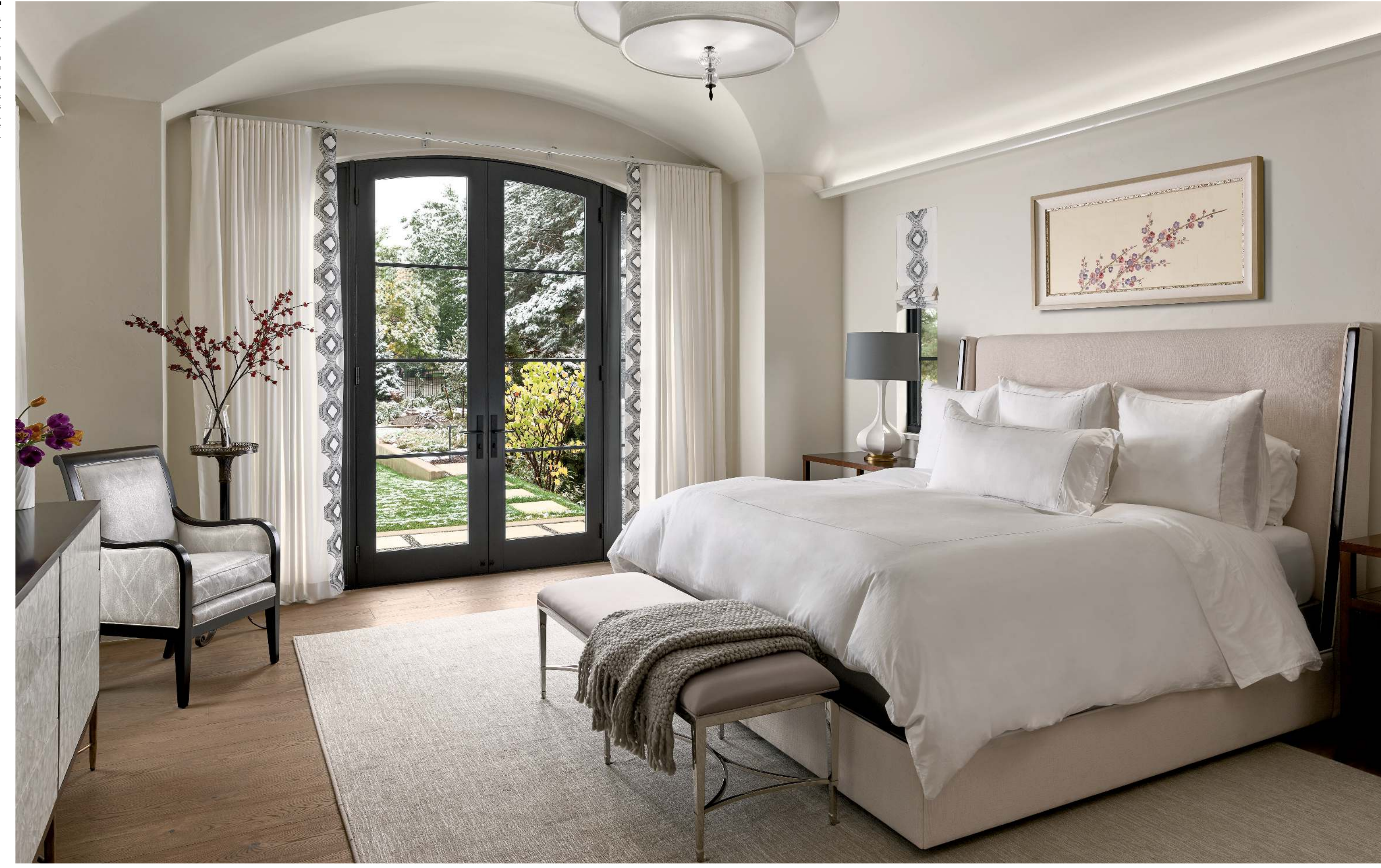
A bevy of textiles creates a lush haven in the master bedroom, starting with the tufted Theodore Alexander Brougham bed, a plush Daphne area rug by Antrim and custom Taffard Fabrics draperies. Cullen also transformed the couple's armchair from their previous home with a shimmering, foiled herringbone jacquard by Zinc Textile.