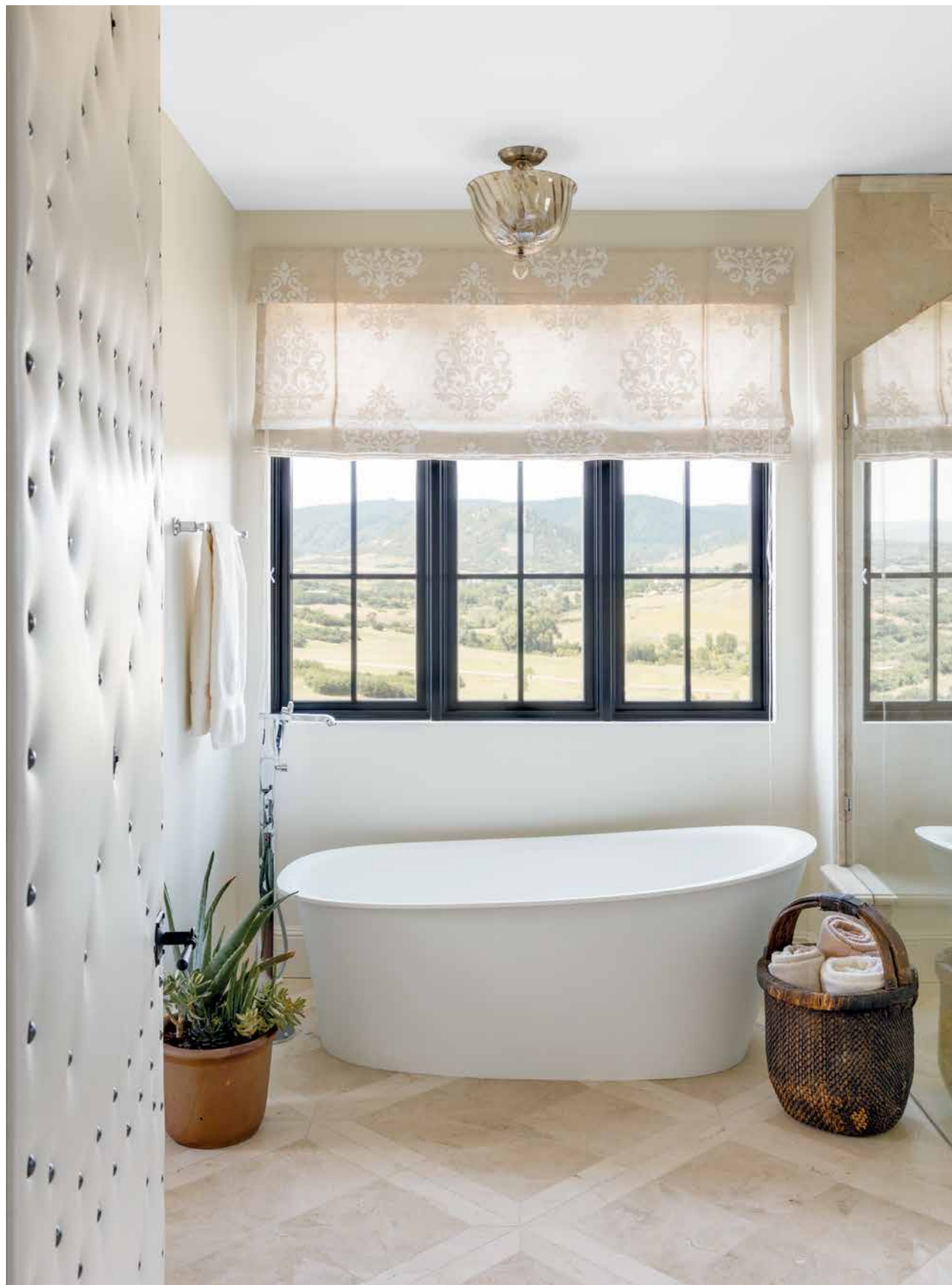
Above: An upholstered door leads to the wife's elegant bathroom, which features a Tulip tub by Wetstyle paired with a filler by Rubinet Faucet Company from Ferguson. The shade fabric is by Schumacher.