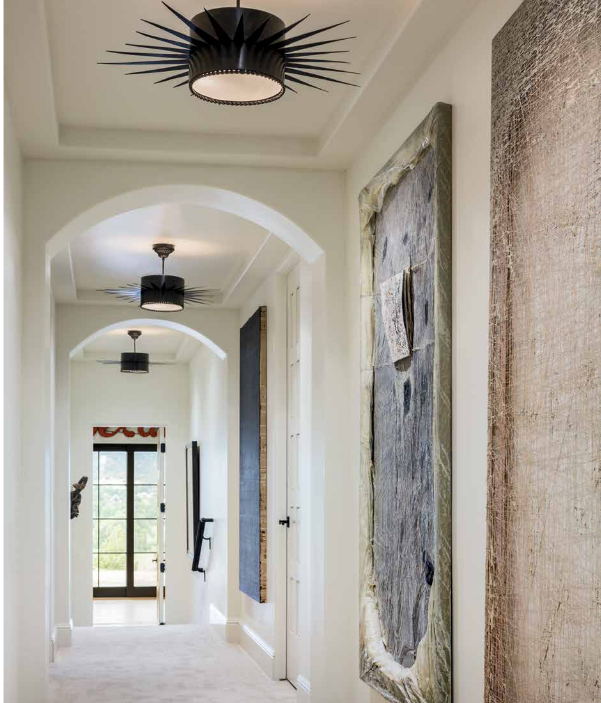
Works by artist Emil Lukas line a lower-level hallway, which was designed to accommodate the homeowners' art collection. The spiky ceiling fixtures by Visual Comfort & Co. offer a striking presence without detracting from the art in the gallery-like environment.

the shade of the window frames and sharpen the more traditional elements. Cullen points specifically to the black trim on the white kitchen cabinets and the pair of aged-brass ceiling fixtures marked by bulbs dangling from black fabric-wrapped cables above the dining and sitting areas.